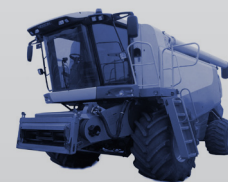
Combine feeder house