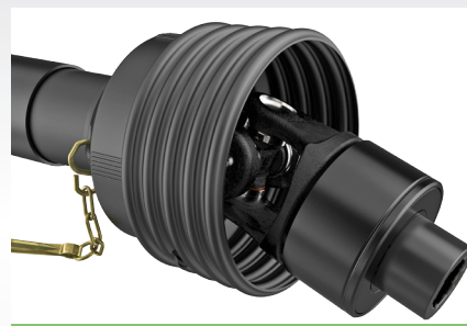
Compact design and low mass