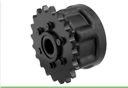
Through shaft option