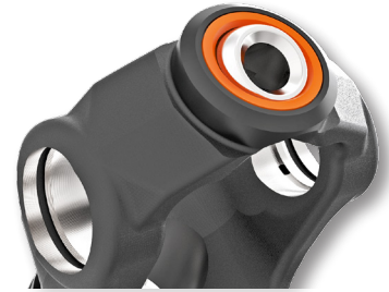
PATENTED HARDENED, SEALED SPHERICAL BALL AND SOCKET