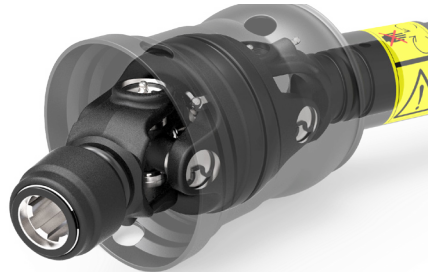
PATENTED COMPACT, ARTICULATED GUARD SYSTEM ANGLED UP TO 80°